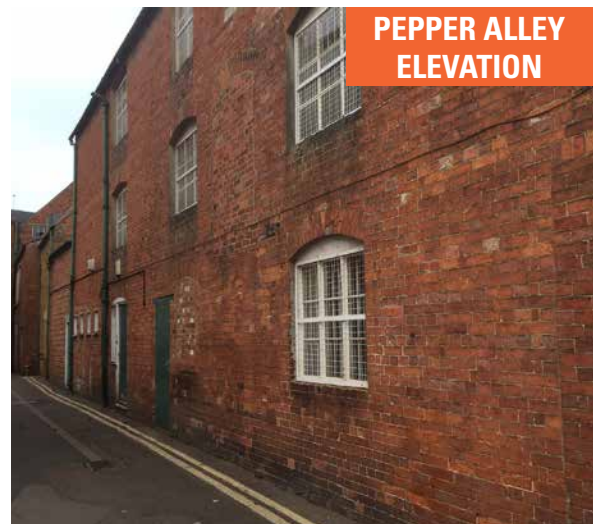
PEPPER ALLEY ELEVATION